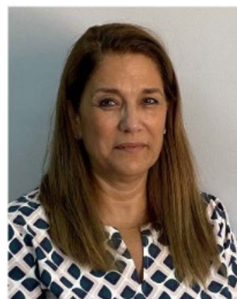
Vana Papaevangelou Greece