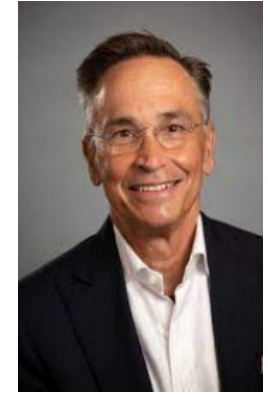
John Ward Task Force