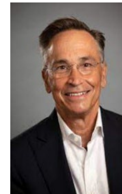
John Ward Task Force